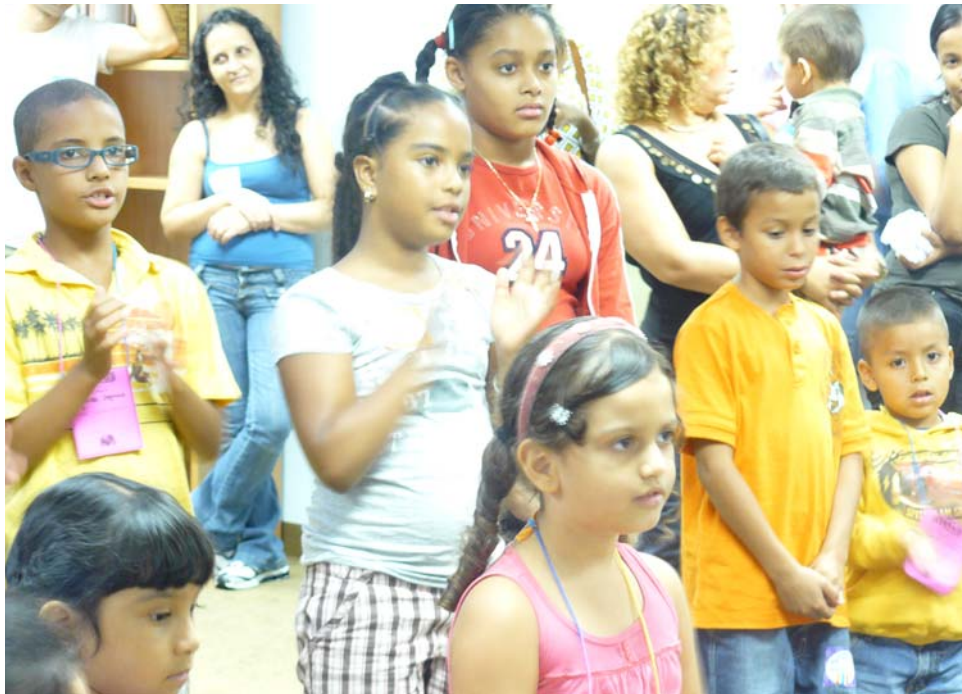
Danbury children learn "Jesus Loves the Little Children of the World" in sign language at the third annual backpack event in late August. A total of 180 school backpacks were distributed, and several children committed their lives to Christ.

Donations of food, snacks, school supplies and materials came from Target, Big Y, Wal-Mart and individuals — including some children. •