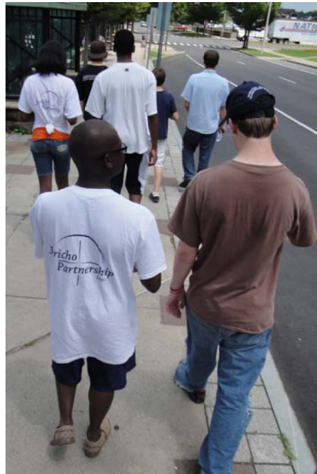
Summer youth missionaries prayer-walk along Kennedy Avenue in downtown Danbury in July.

"I know God wants Jericho to succeed, to have individuals and the community be impacted by His goodness," she said. "We have so much power when we're united in prayer and united in agreement with God's plan for our community."