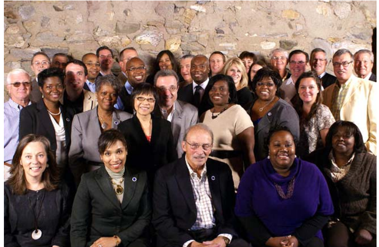
Jericho Partnership ministry leaders, partner pastors, executive board and staff gather for a group photo.

congregations in greater Danbury, and raise $5 million to help fund more than 15 hands-on ministries, all by 2012.” •